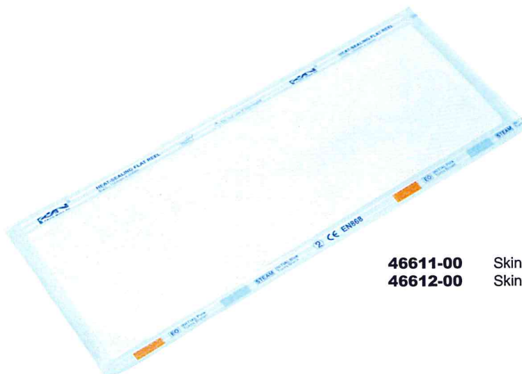
46611-00 Skin graft carrier > 1,5:1 (Box of 20) 46612-00 Skin graft carrier > 3:1 (Box of 20)