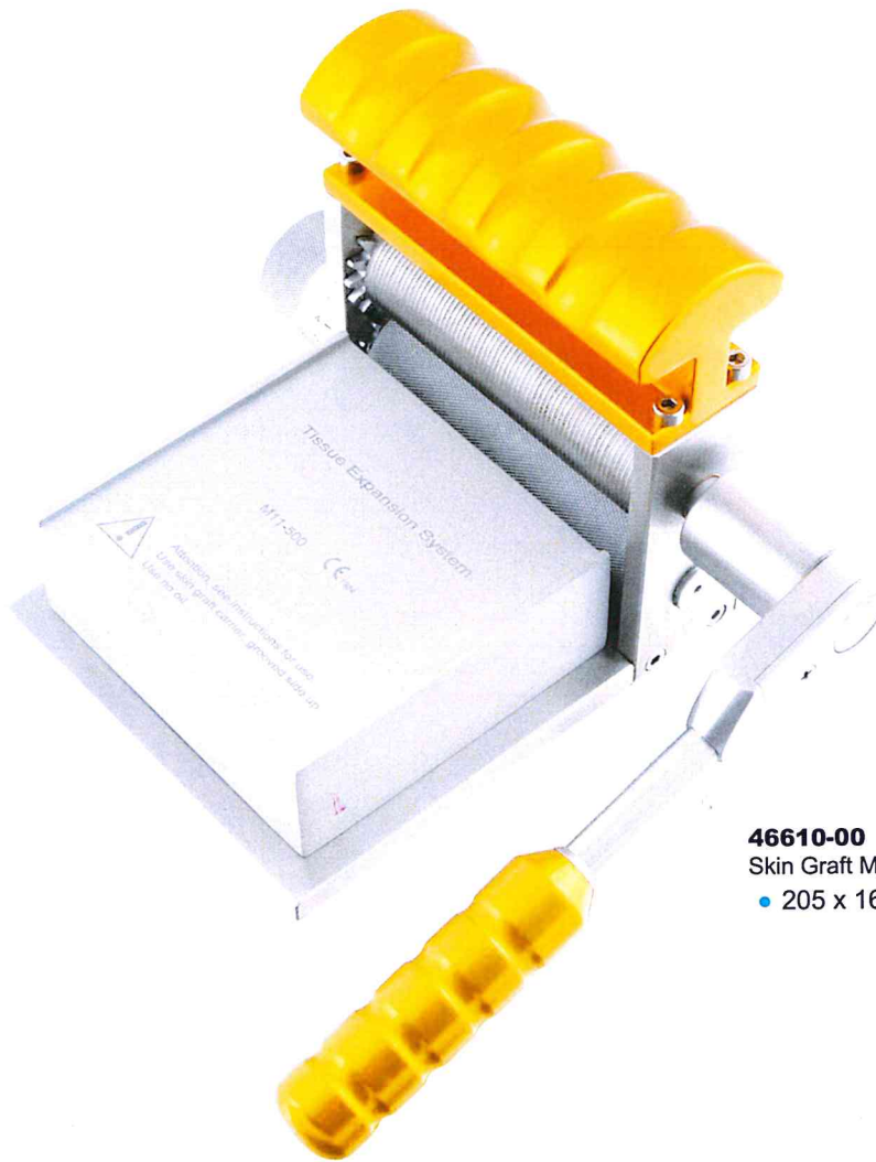
46610-00 Skin Graft Mesher • 205 x 165 x 120 mm / 4000 g